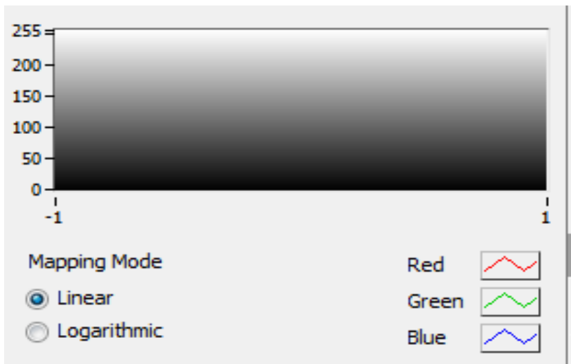
Gray level variation in one pixel when 8 pictures process one by one